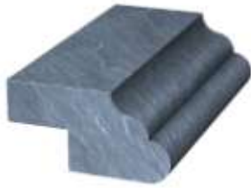
3/4" Ogee/ Bullnose