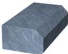
3/8" x 3/8" Bevel