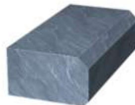
1/4" x 1/4" Bevel