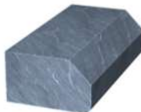
1/2" x 1/2" Bevel