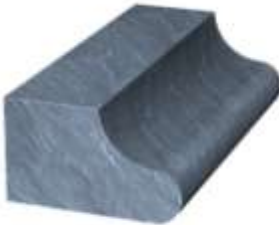
1-1/4" Ogee Bullnose