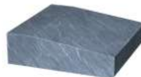
3" x 3/8" Bevel