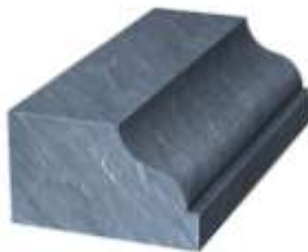
3/4" Ogee with 1/8" Reveal